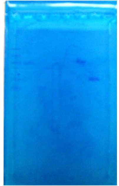
GEL 3 (fresh corn)