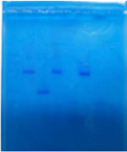
GEL 1 (Organic tomato)